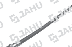
12480-8 (300mm) FLEX. FREIO DIANT. H-100