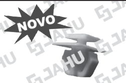
12934-6 GRAMPO MOLD. LAT. INT. TUCSON