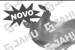
12860-8 GUIA PORTA CORRER INF. (CPTA) H-100/L-300