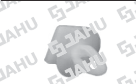
12675-8 GRAMPO FRISO LAT. HYUNDAI