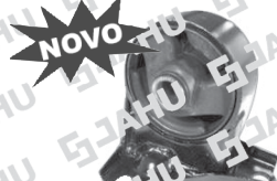
12967-4 (COMUM) 12278-1 (ORIGINAL) COXIM MOTOR FRONTAL (AUTOMÁTICO) TUCSON 2.0