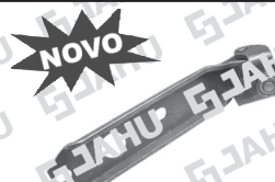
12859-2 GUIA PORTA CORRER CENTRAL H-100/L-300