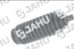
12628-4 G.PÓ CX. DIREÇÃO HUNDAY H100 CX. KOYO