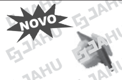
12789-2 GRAMPO FORR. INT. TUCSON