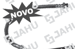
12900-1 (490mm) FLEX. FREIO DIANT. TUCSON 05/...