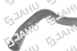
15861-2 (COMUM) 12087-9 (ORIGINAL) MANG. RAD. INF. H-100 94... S/DH