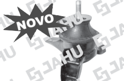
12965-0 (COMUM) 12255-2 (ORIGINAL) COXIM MOTOR DIR. (HID) TUCSON 2.0