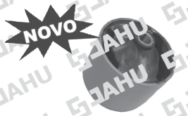
12892-9 COXIM CÂMBIO HR FURO DIAM. 10MM