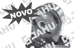
12966-7 (COMUM) 12280-4 (ORIGINAL) COXIM MOTOR FRONTAL (MANUAL) TUCSON 2.0