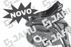
12963-6 (COMUM) 12283-5 (ORIGINAL) COXIM MOTOR ESQ. (2WD) TUCSON 2.0