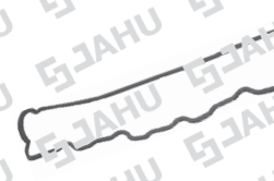
12103-6 JUNTA TAMPA VÁLV. H-100