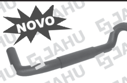
15751-6 (COMUM) 12080-0 (ORIGINAL) MANG. REFRIG. H-100 DIESEL 2.5 93/... (18X9)