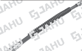
12481-5 (342mm) FLEX. FREIO TRAS. H-100