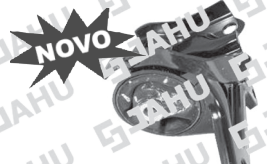
12964-3 (COMUM) 12279-8 (ORIGINAL) COXIM MOTOR ESQ. (4WD) TUCSON 2.0