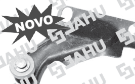
12858-5 GUIA PORTA CORRER SUP. H-100/L-300