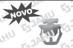
12935-3 GRAMPO MOLD. LAT. EXT. TUCSON