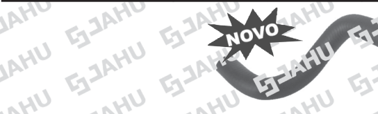
15860-5 (COMUM) 12088-6 (ORIGINAL) MANG. RAD. SUP. H-100 94... C/S-DH/ACD