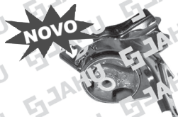
12962-9 (COMUM) 12284-2 (ORIGINAL) COXIM MOTOR ESQ. TUCSON 2.0