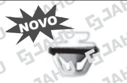
12790-8 GRAMPO FORR. EXT. TUCSON