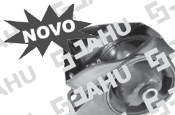
12968-1 (MANUAL) 12969-8 (AUTOMÁTICO) COXIM CÂMBIO TRAS. TUCSON 2.0